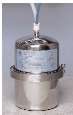
MP750SB or MP1200EL